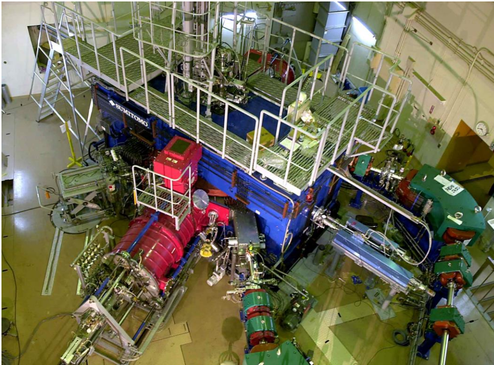
930 AVF cyclotron (Multiple use, K=110)